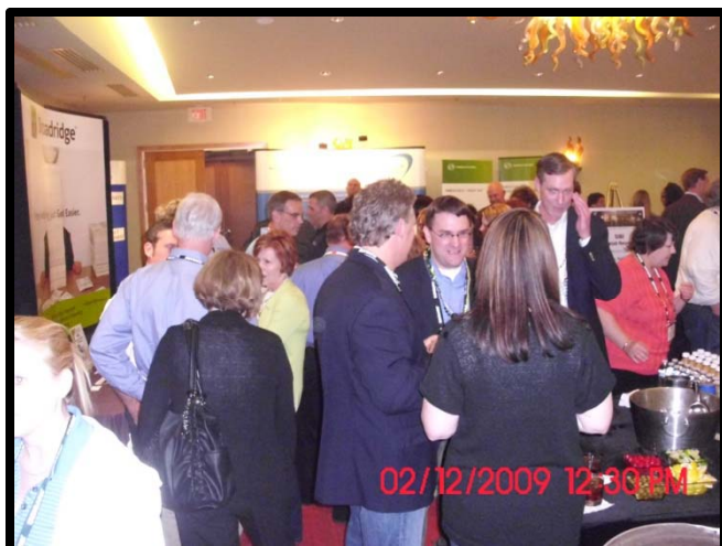
Trust User Group (TUG) Participants with attending Vendors at evening reception – April 17 th .